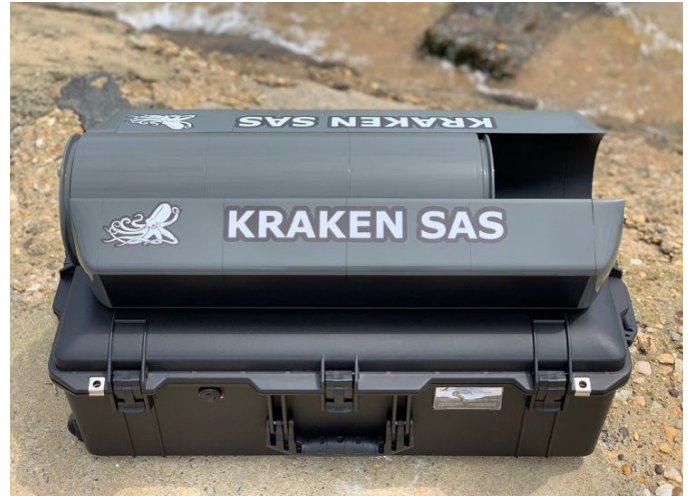
» SAS payload module with embedded real-time processor designed for 7.5"-9" diameter man-portable AUVs.

array, achieving the resolution gains of a much larger array while dramatically increasing the area coverage rate relative to conventional sidescan sonar. Until recently, most SAS systems required large AUVs as host platforms to accommodate large, low frequency sonar arrays and to avoid the nonlinear trajectories of smaller vehicles. Now, miniaturized high frequency SAS systems can suppress multipath using narrow vertical beams and correct for nonlinear trajectories using sophisticated motion estimation algorithms. Miniaturized high frequency SAS is particularly advantageous in shallow water conditions where ping-to-ping integration enhances the seabed signal in strong multipath conditions.